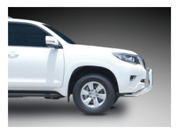
76mm Series 2 Nudge Bar